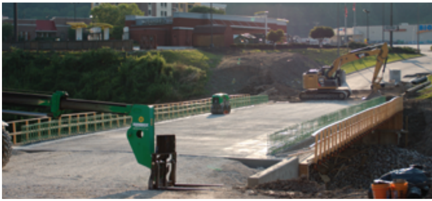
Left: Construction crews prepare the roadway leading up to the new bridge.